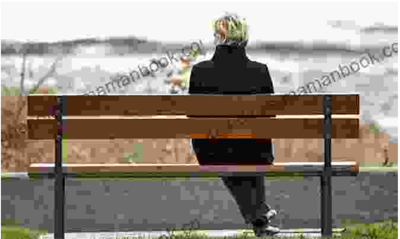
Image of a woman sitting alone on a park bench, symbolizing the loneliness and isolation that can accompany heartbreak.

Bang also delves into the complexities of desire, the unfulfilled longing that can both fuel and torment us. In "The Want," she explores the bittersweet nature of desire, the way it can both consume and liberate us.