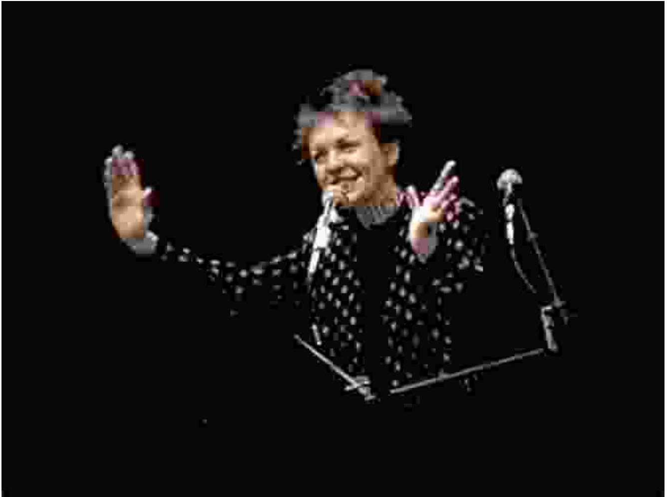
Laurie Anderson performing 'Deep Down Dead' in 2001.